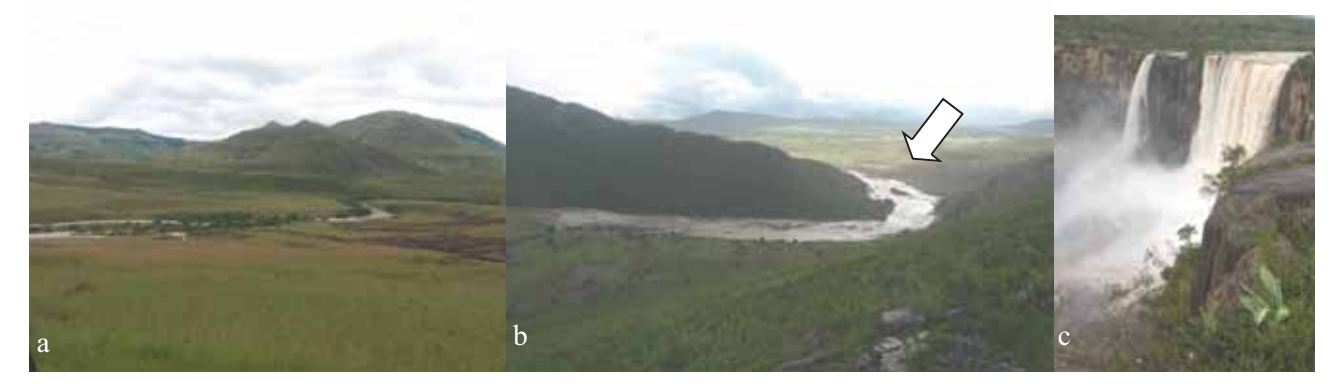
Figure 2– photographs taken of the proposed sites during March 2014 where a) Proposed Ntabelanga Dam basin site; b) Proposed Laleni Dam wall location; and c) Tsitsa Falls.

Additionally, the feasibility study has identified 2 868 ha of high potential land suitable for irrigated agriculture ( Figure 1 ). About 2 450 ha of the land lie in the Tsolo area and the rest near the dam and along the river. Agricultural land will be supplied with raw water pumped from Ntabelanga Dam and in some places water will be pumped through pipelines from the nearest river abstraction point on the Tsitsa River, downstream of the dam.